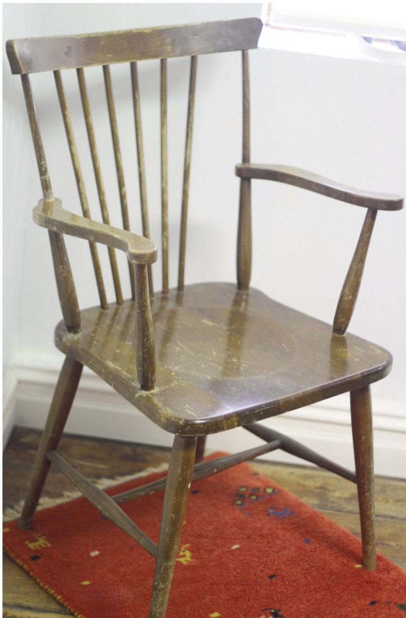
FISCHER'S USUAL CHAIR AT BRAGI'S SECOND HAND BOOK SHOP IN REYKJAVIK, AT THE BOBBY FISCHER CENTER IN SELFOSS, ICELAND.