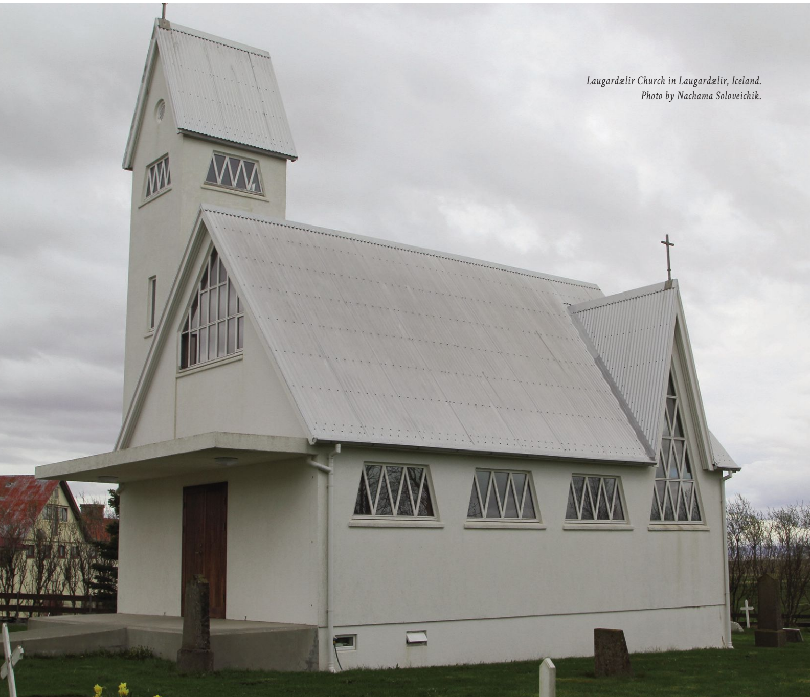
Laugardæll Church in Laugardæll, Iceland.

“We all remember Fischer's eccentricities, which were widely published,